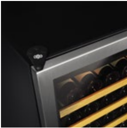
Glass door with stainless steel frame