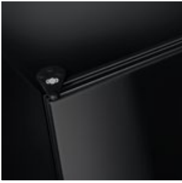
Black piano solid door