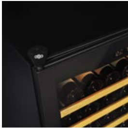
Full Glass door

For aesthetic appeal, Revelation's cabinet body is in black, stainless steel or leather.