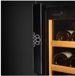
Glass handle decorated with the EuroCave logo, detachable 1